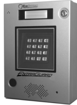
Standard Keypad (Shown Without Hooded Enclosure)