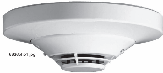
SS-T in SS-B6 base