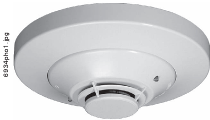
SS-P with SS-B6 base