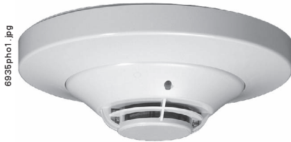
SS-M with SS-B6 base