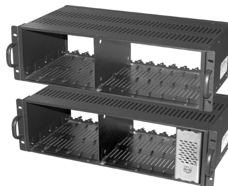
RK5000-3U (TOP) RK5000PS-3U (BOTTOM)

The relay output connector on the back of the EPS5000-120 is tied to the alarm LED. The alarm LED turns red when there is an alarm condition, such as the loss of the optical signal or the video signal. The relay will close or open, depending on whether it is set to normally closed (N.C.) or normally open (N.O.). The 6-pin power connector allows you to connect an over-molded cable (supplied) from the EPS5000-120 to either the RK5000-3U or the RK5000PS-3U. The power fail LED turns red when there is a problem with the power supply that can cause it to fail. If one of the power supplies fails, the blue Pelco badge will turn off.