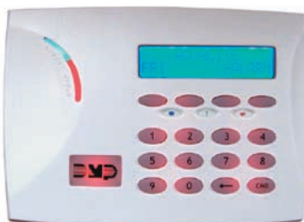
Red Backlighting for Alarm Conditions

In a normal state, both the keypad and logo backlighting remain Blue on Aqualite keypads or Green on Thinline keypads. However, during an alarm state, the keypad and logo turn Red . The change in color allows persons on-site to instantly recognize an alarm condition.