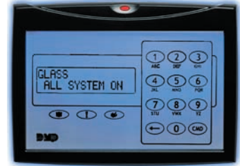
Blue touchscreen display turns Red for alarm conditions.

An attractive new user interface featuring a glass touchscreen instead of traditional keys. Available in White, Black or Platinum, the 7760 adds elegance and style to any installation.